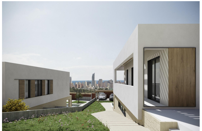
Villa 14 Plot: 542,40 m 2