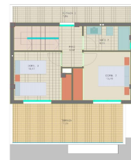
PLANTA ALTA TOP FLOOR