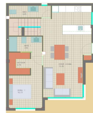
PLANTA BAJA GROUND FLOOR