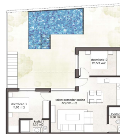
PB / GROUND FL.