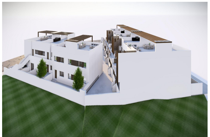
VIVIENDA TIPO Nº05 - 3 DORMITORIOS